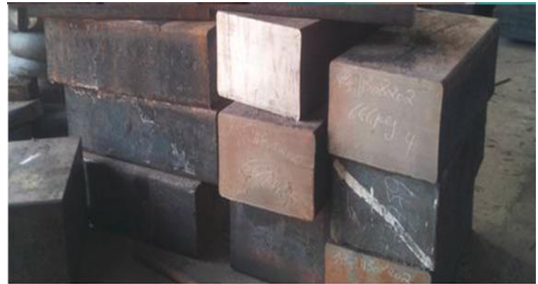
Cut the raw material