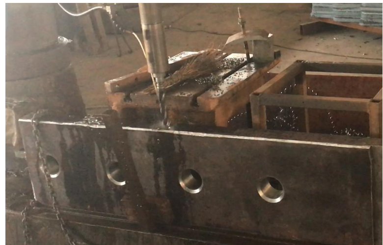
Drilling the side hole