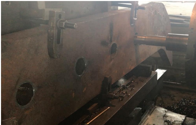
Drilling the big hole