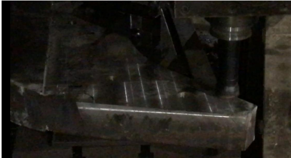
Milling the tip