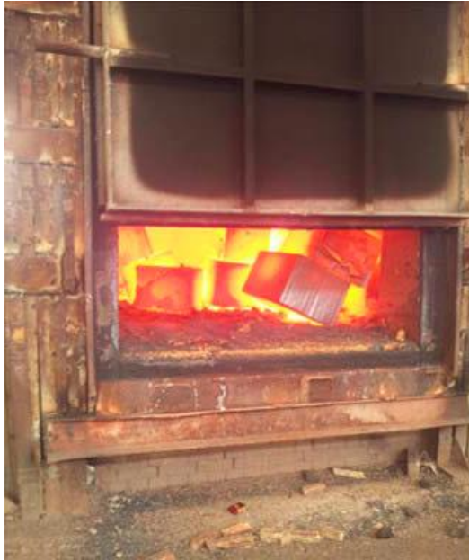
Heating the material