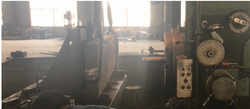
Load the material