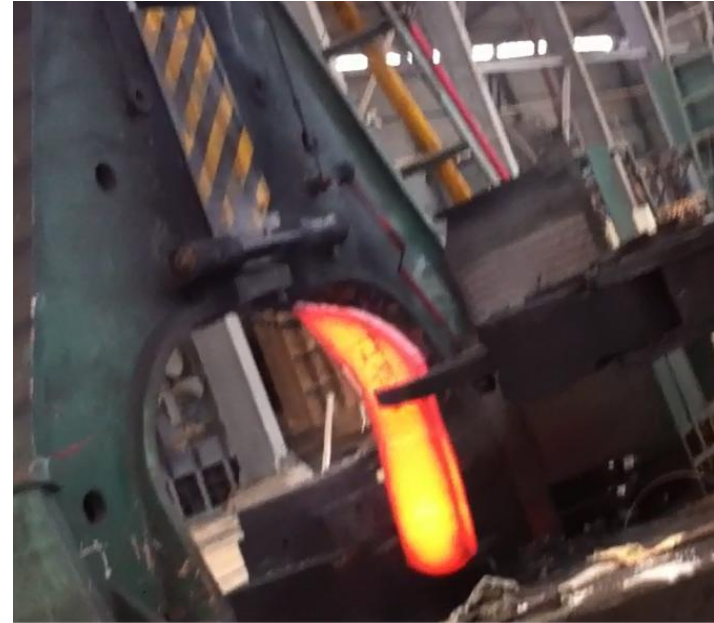
Hammering to the shape