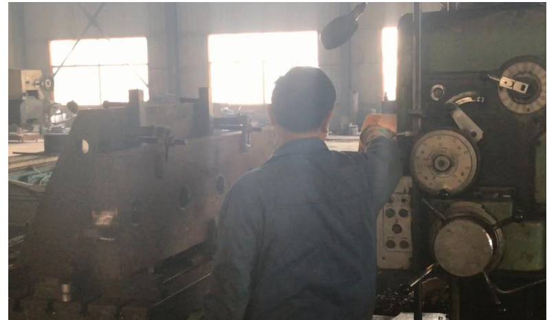
Setting the parameter